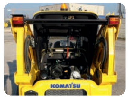
The bonnet: quick engine check