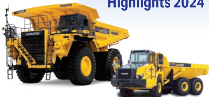
Articulated dump trucks Rigid dump trucks Electric dump trucks