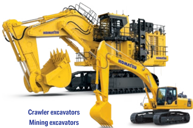
Crawler excavators Mining excavators